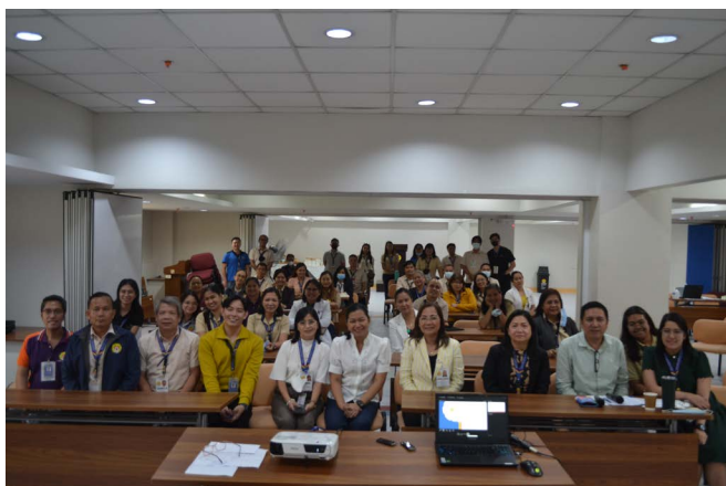
Participants of the training on RA 9184 and its 2016 IRR.