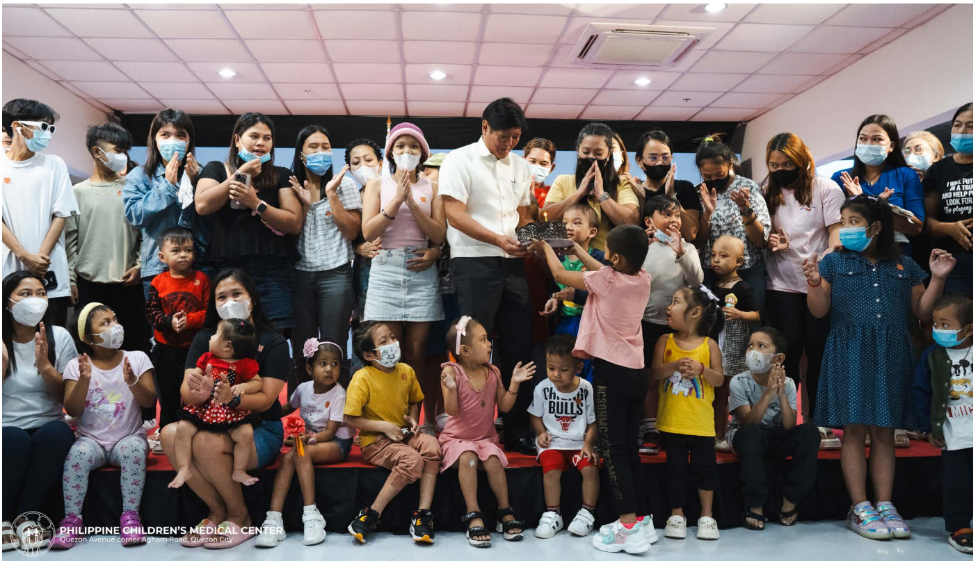
Patients of the Philippine Children's Medical Center join President Ferdinand R. Marcos, Jr., in a group photo during the observation of Childhood Cancer Awareness Month on September 10, 2024.