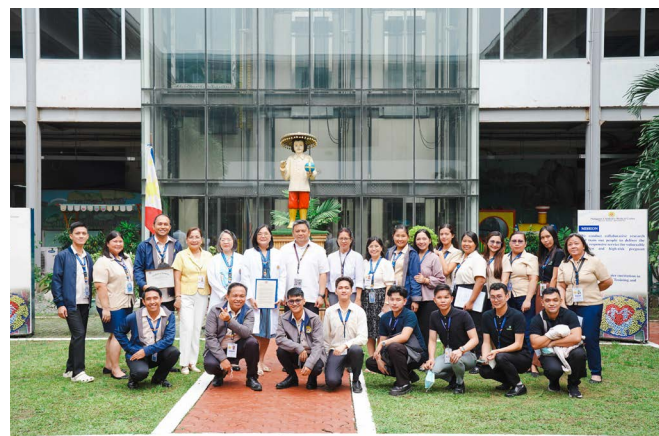
Top Management, CSC Director with the Human Resource Management Division Personnel