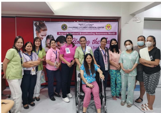
Participants: Energetic mothers during the afternoon session joined by some members of the Breastfeeding Committee

kindness of all new donors this year, and for the selfless love and strength seen from all mothers who serve as an inspiration to the whole community to continue this program and strive to make things better.