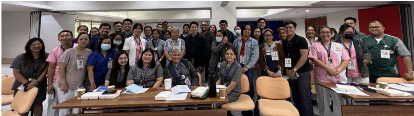
Attendees of the Work Conflict Management and Prevention Seminar