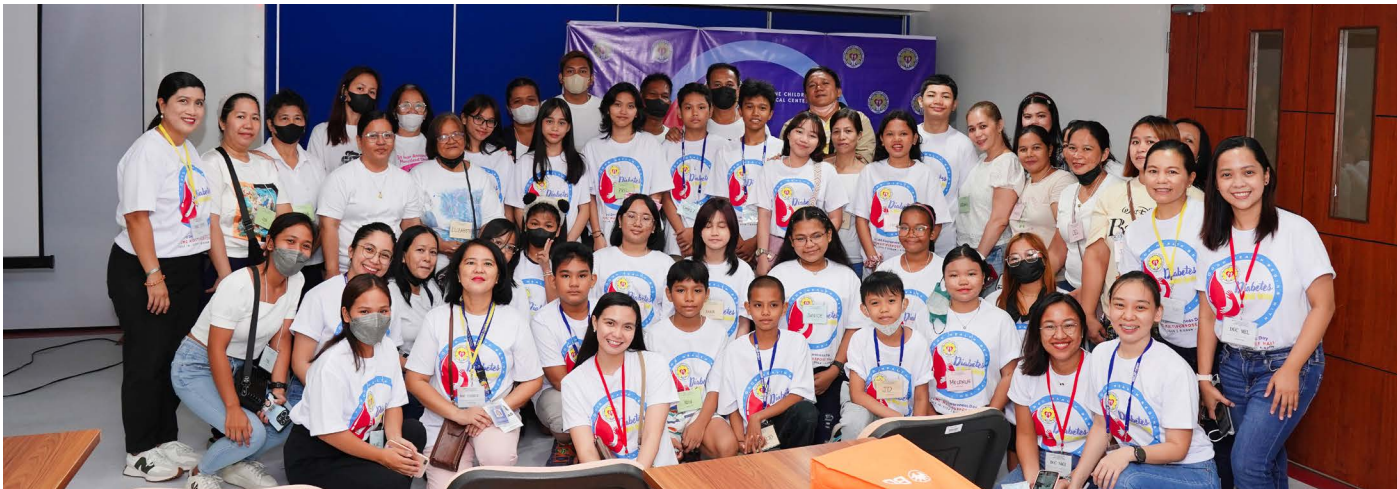
Facilitators and participants of the 3rd PCMC Diabetes Mellitus Awareness Day.