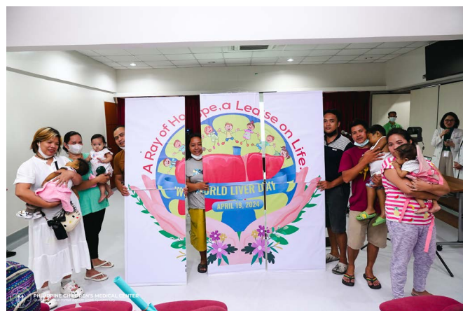
Parents and patients arrange the banner of the theme of celebration of World Liver Day celebration.

The number of Filipino children being diagnosed with Biliary Atresia and other neonatal cholestatic liver