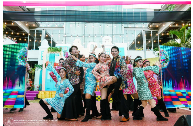
UNDEFEATABLE. The nursing services remains invincible for three consecutive years.

After the captivating performances of the teams, the Nursing Services team emerged as the winner of this year's competition. Their performance was full of energy, precision, and a heartfelt rendition of the iconic song "Dancing Queen." Their well-deserved win was met with thunderous applause and cheers from the audience.