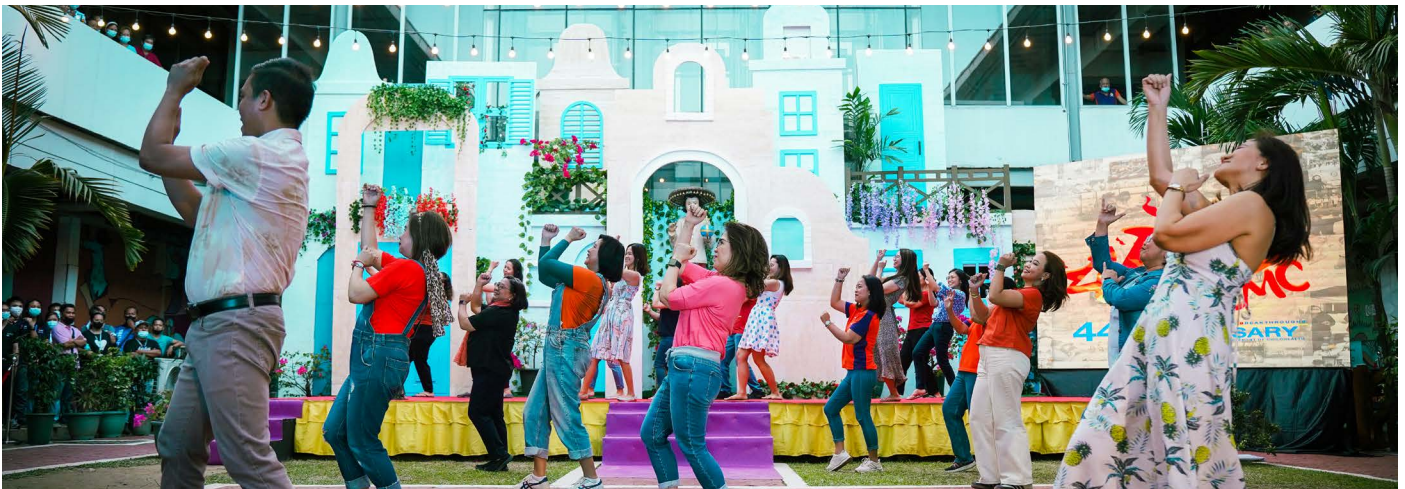
Officials and members of the 44th PCMC Anniversary Committee perform an intermission number during the celebration of 44th PCMC Anniversary on April 26, 2024 at the Sto. Niño Atrium.