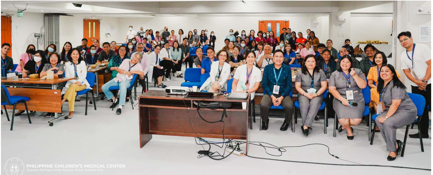
Participants of the Security Incident and Data Breach Notification Workshop.