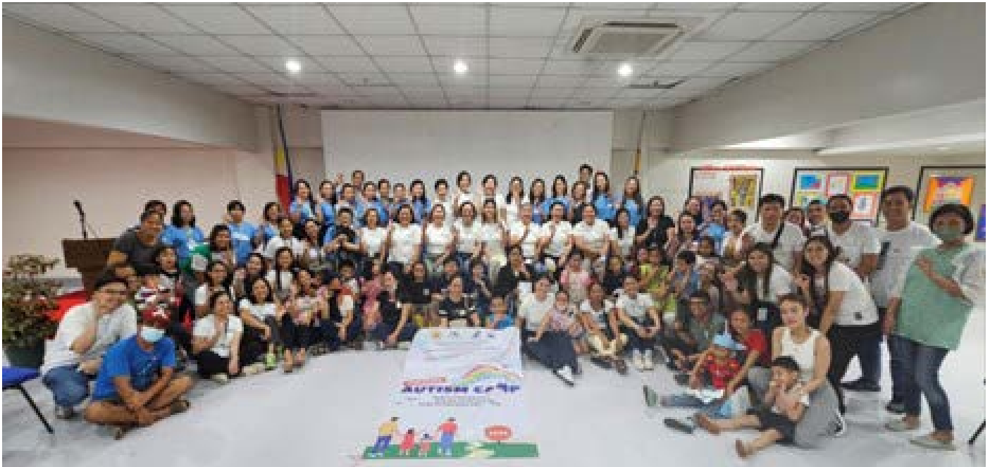
Officers and staff of Section of Neurodevelopmental Pediatrics with the resource speakers and participants of the Autism Camp held on April 27, 2024 at the PCMC Multipurpose Hall.