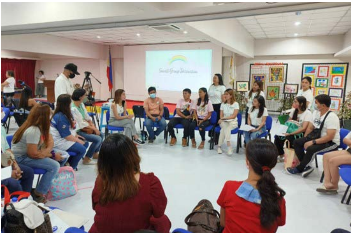
Participants during the open forum activity.

by the consultants from the PCMC Child Neuroscience Division (CNS) and CDIFI educators.