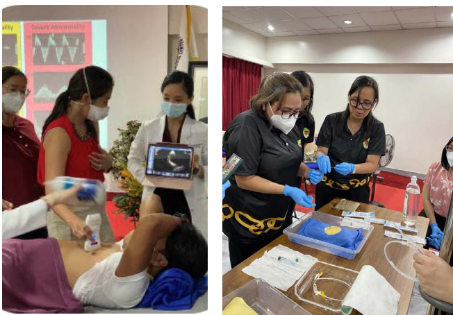
Participants join the activities.

In celebration of National Kidney Month in June, the Section of Nephrology hosted the 2nd Dr. Joel S. Elises Memorial Lecture in remembrance of one esteemed mentor and friend. It was held at the PCMC Multipurpose Hall on June 24, 2024.