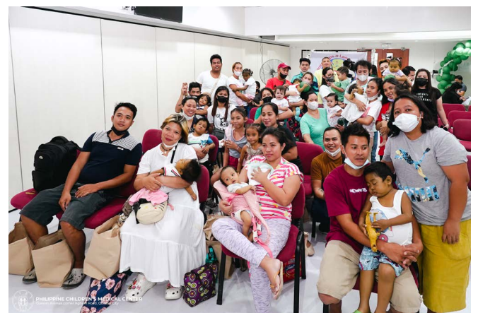
Parents and patients attend the World Liver Day celebration in Multipurpose Hall.

At the World Liver Day Celebration, which had as its theme "A Ray of Hope, a Lease on Life," the two transplant patients were present. A lay forum was also held to raise awareness of liver disease and talk about PCMC's and the government's pediatric liver transplantation program. The program also plans to recognize the consortium that gave hope to the families of patients with liver illness, as well as the work of PAsLiT's benefactors, including Senators Christopher Lawrence "Bong" Go and Pia Cayetano, who were both in attendance.