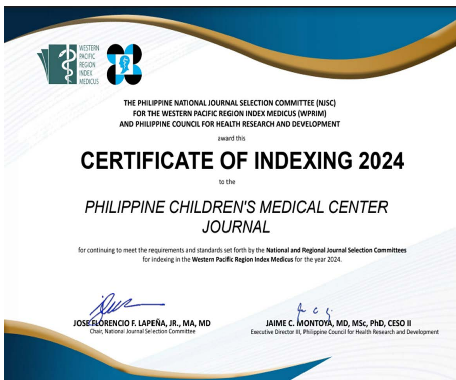
The Certificate of Indexing issued to the PCMC Journal for continuing to meet the requirements and standards of the National and Regional Journal Selection Committees (NJSC) for indexing in the Western Pacific Region Index Medicus (WPRIM) for the year 2024.