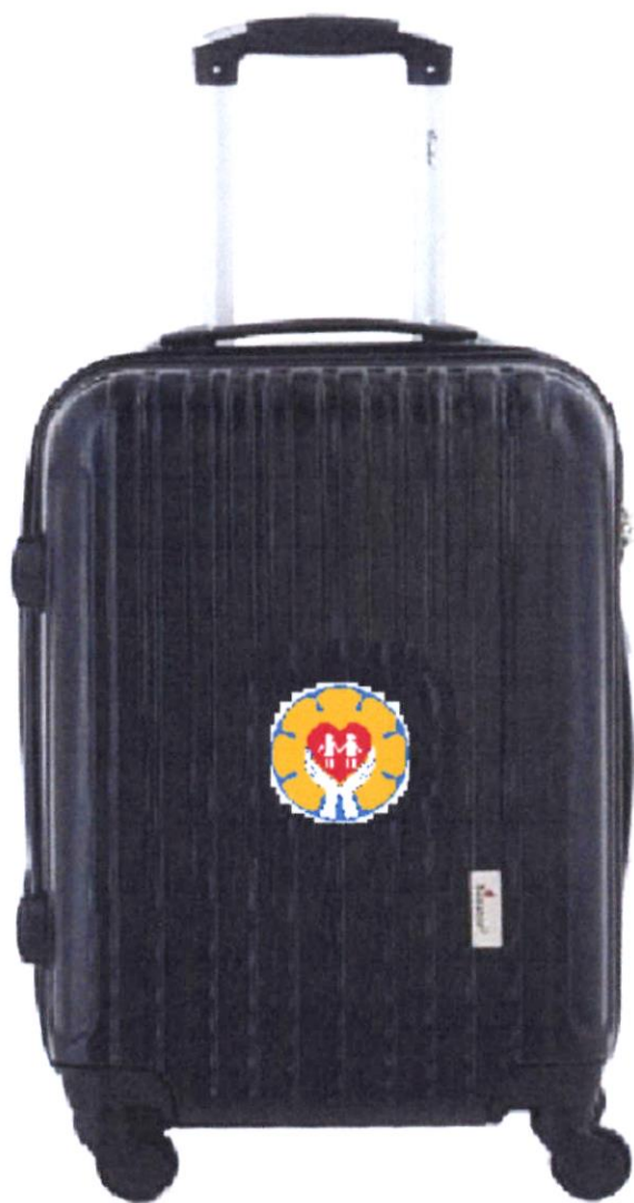
Traveling luggage bag with PCMC Logo