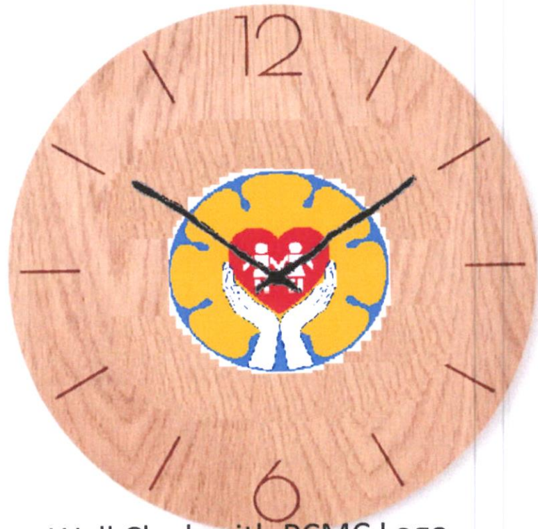
Wall Clock with PCMC Logo