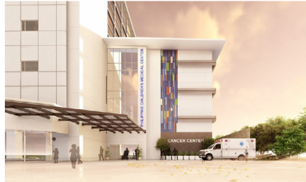
Cancer Building perspective