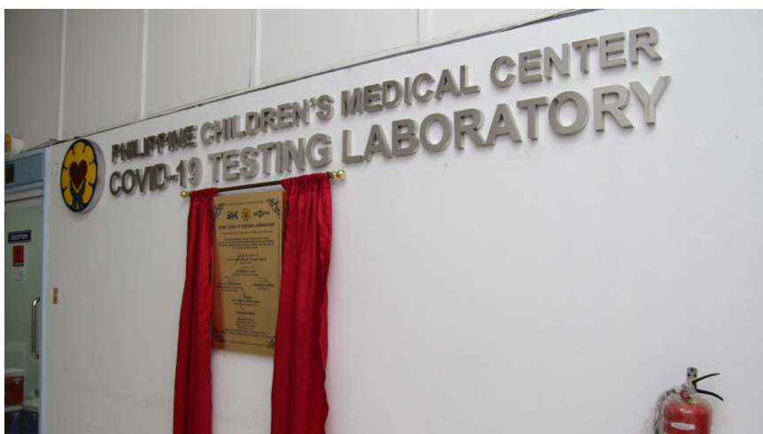
PCMC Covid-19 Testing Laboratory