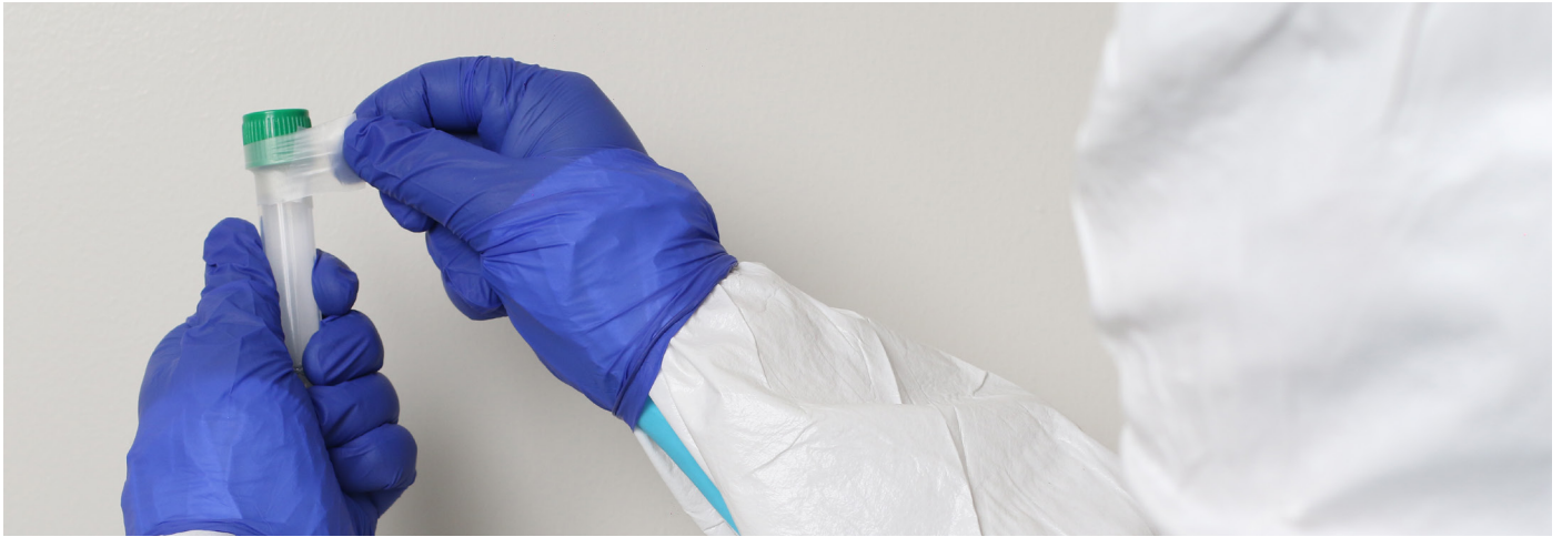
FILE PHOTO. A medical technologist seals the specimen before sending it to the laboratory for testing.