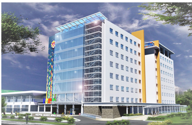
The perspective of eight-storey building.