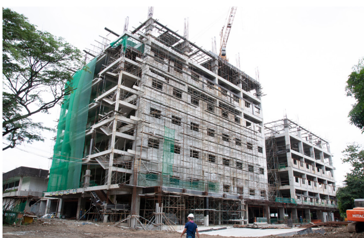
The ongoing construction of eight-storey building for charity patients and OPD.

expand the capacity of the hospital from 200 to 500 beds and would improve the delivery of services of the medical center.