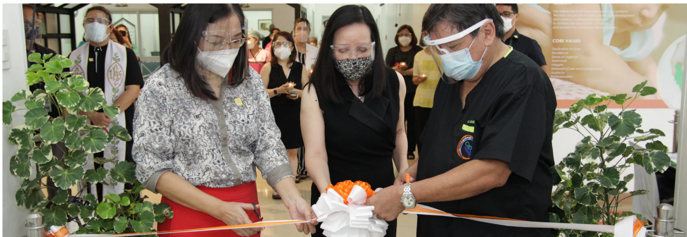
The management, doctors and employees of PCMC inaugurated the extension of the Doctors' Clinics last June 14, 2021.