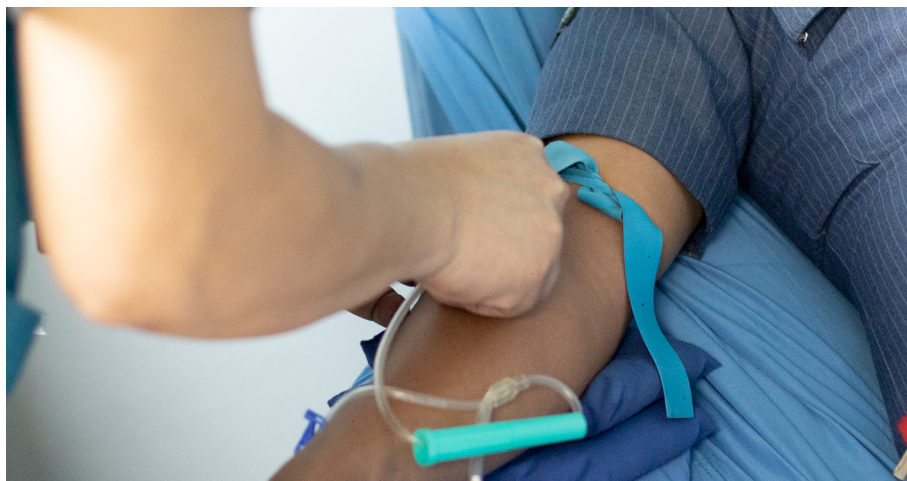
FILE PHOTO. A volunteer donates blood at the PCMC Pediatric Blood Center.